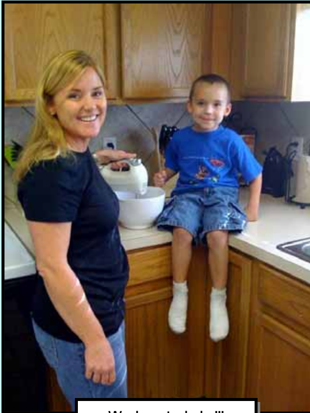
We love to bake!!!