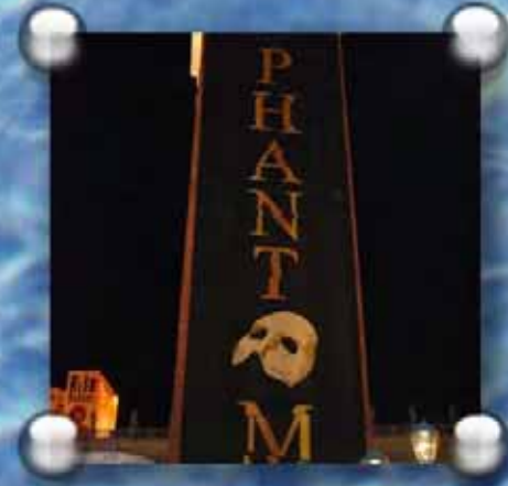
Vacation in Las Vegas. What a great show.