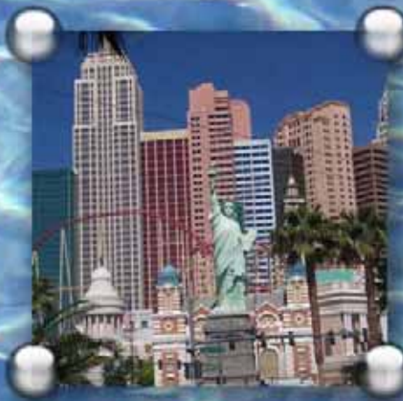
Another picture of Vegas