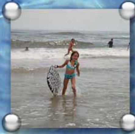
Playing in the water with my nieces and nephews