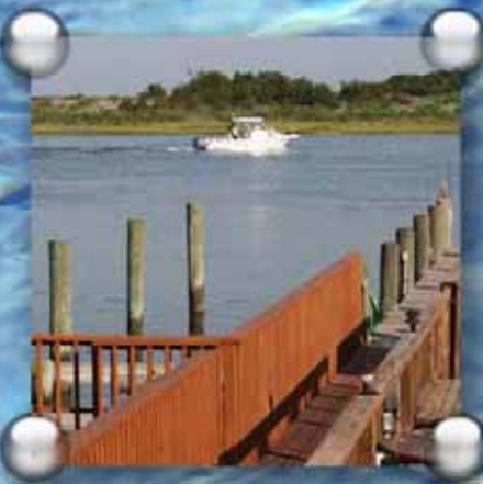
Looking from the back porch at the shore house we rent.