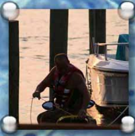
Having fun on the jet ski with friends.