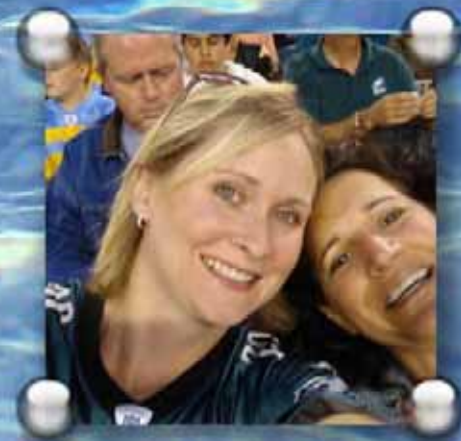
At the Eagles game with a friend.