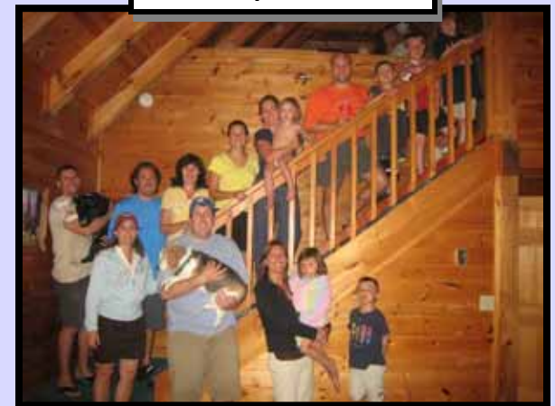
Family at the Great Smokey Mountains