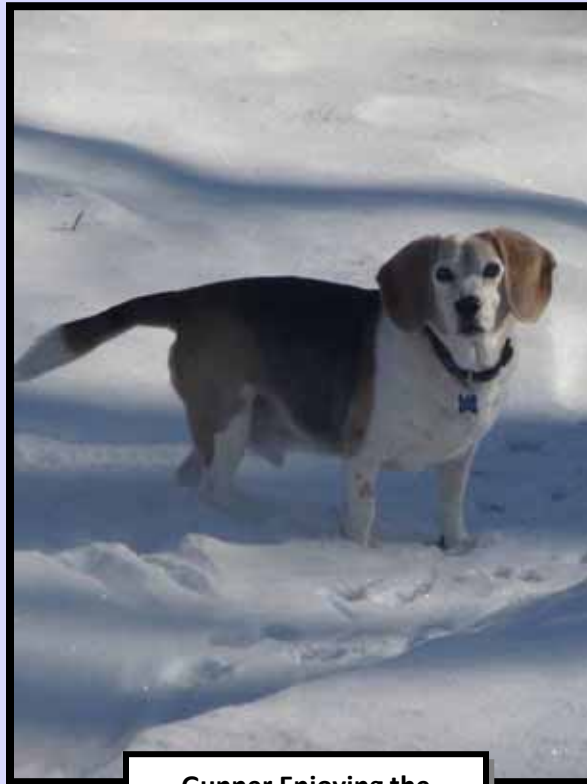
Gunner Enjoying the Winter Snow