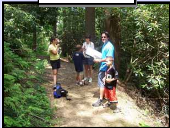
Hiking in the Great Smokey Mountains

A few of the more memorable trips have included time spent at the Jersey shore and Great Smokey Mountains with Vanessa's family and Cape Cod and Orlando with Tim's. Our most memorable trip was to Brazil, where we watched Tim's brother compete internationally for the USA.