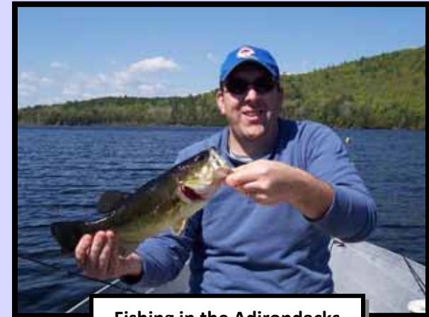
Fishing in the Adirondacks Nice Bass!