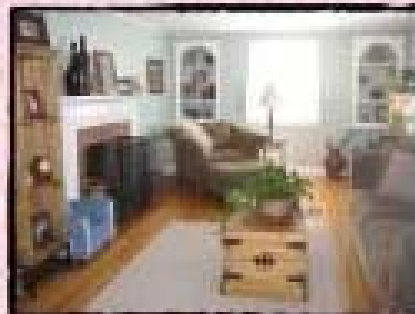
The Family Room.