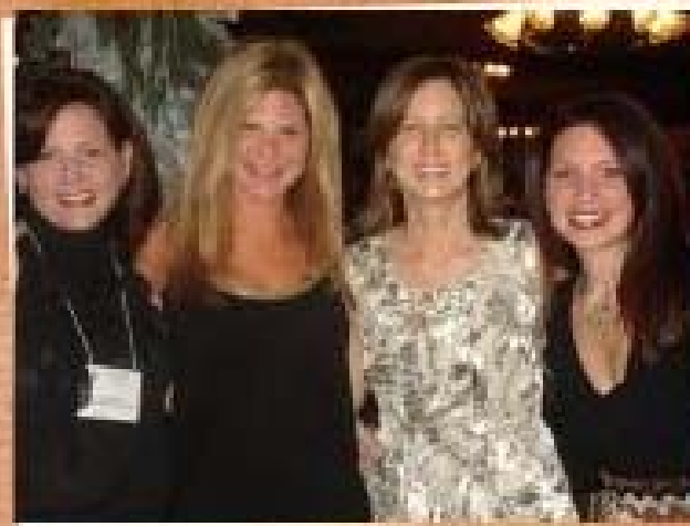
Three of my closest friends since childhood.

I have built strong friendships with people throughout every stage of my life and many of my closest friends I've known since high school and grade school. My friends are very supportive of my wish to adopt a child.