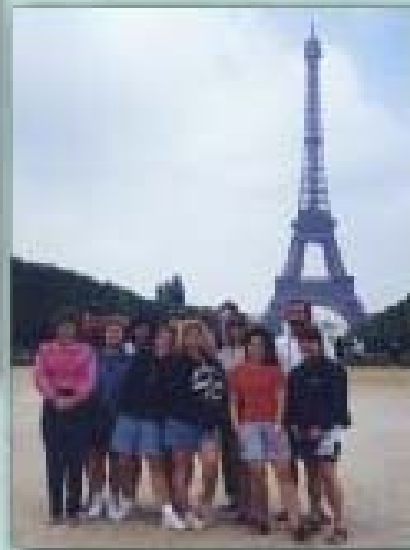
Me and some friends traveling in Paris near the Eiffel Tower.