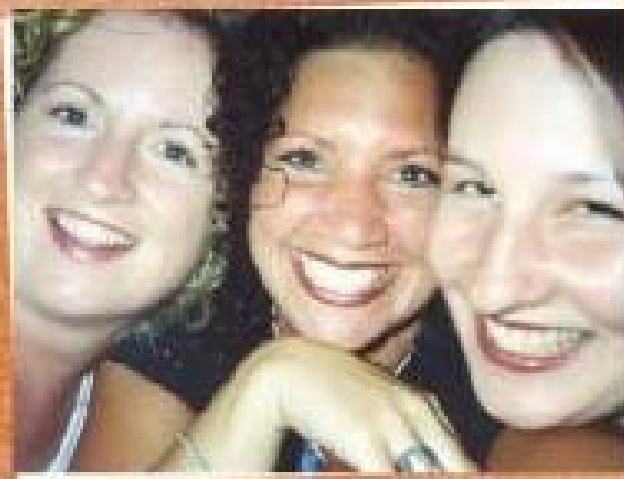
Two of my dear girlfriends from Boston.