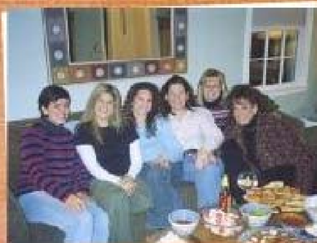
Girls night out for my friend's birthday.