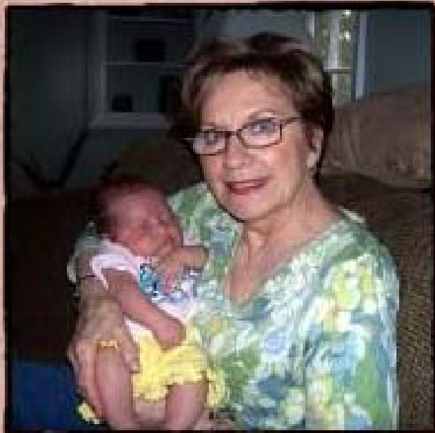
Top Left: Grammy with a new Isabella Top Right: Grampy with Isabella on Halloween.