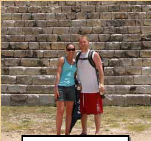
Visiting the Ruins