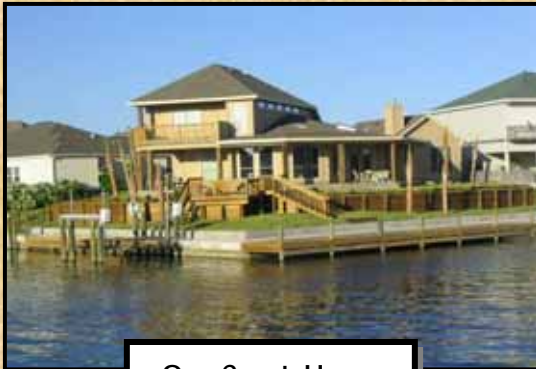
Our Coast House