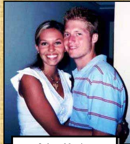
Cabo, Mexico Our First Vacation