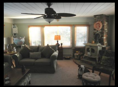
Our Family Room