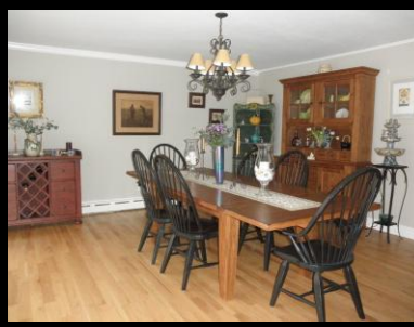
Our Dining Room where many gatherings occur