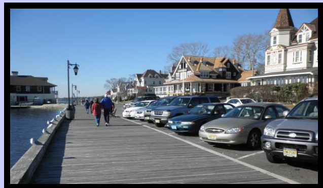
Around the corner and one block away from our house