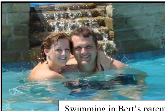
Swimming in Bert's parents' swimming pool