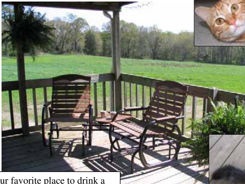
Our favorite place to drink a cup of coffee; the back porch.

We love our house! It is a four bedroom, and two bathroom house with approximately 1,950 square feet. Your baby will have his or her own room! Our house is located in the middle of our property, but away from the cows, as you can see. We all live about 400 feet away from each other, which gives us plenty of privacy, but thankfully, we can never be lonely. Although we live out in the country, we are very close to town. For us, it is absolutely perfect!