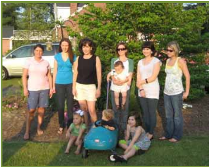
The girls and the kids