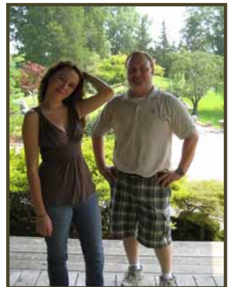
Cheekwood Mansion in Nashville, Tennessee