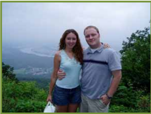
Rock City at Lookout Mountain in Chattanooga, Tennessee