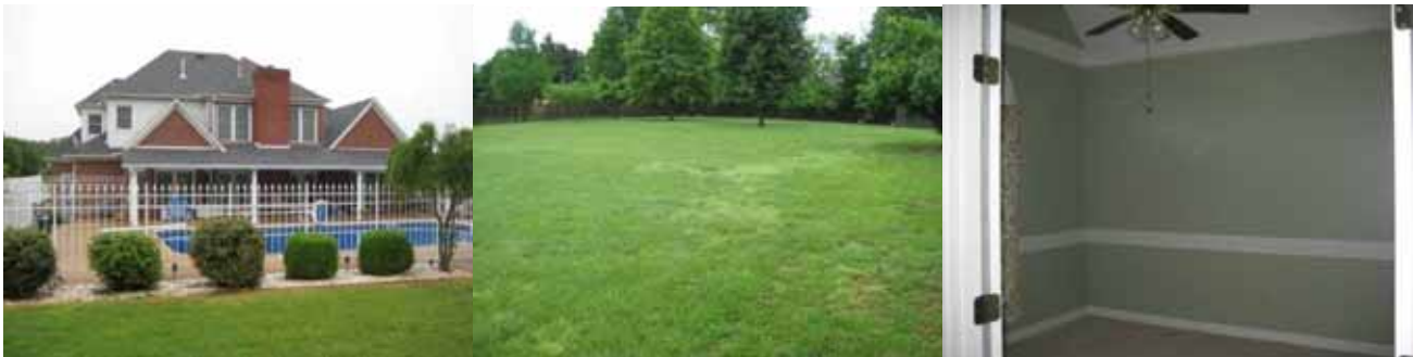
Our back yard and the room that will be the baby's room