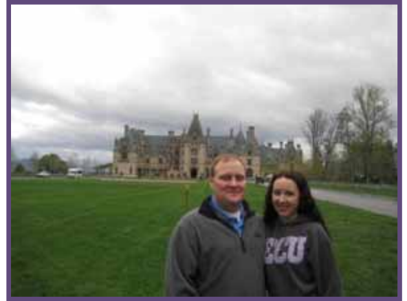
Biltmore Estate in Asheville, North Carolina