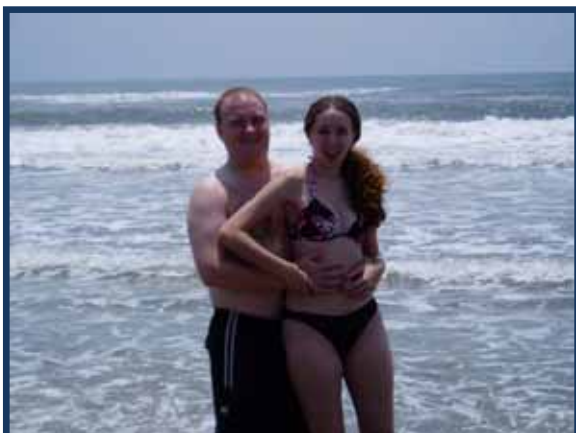
Atlantic Beach, North Carolina