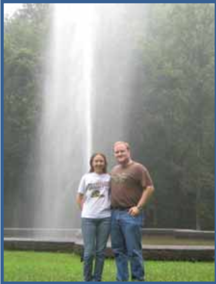
Andrews Geyser in Old Fort, North Carolina