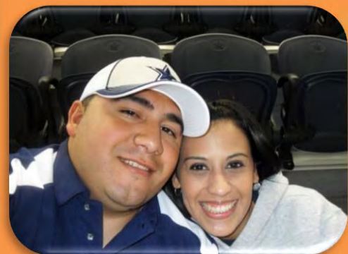
Enjoying the Dallas Cowboy Game