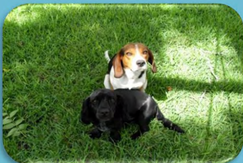
Patches and Shiner