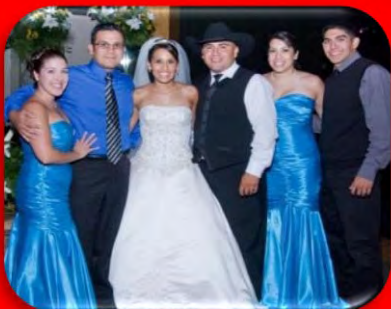
Our close friends