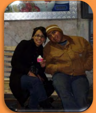
Enjoying Gelato in Rome