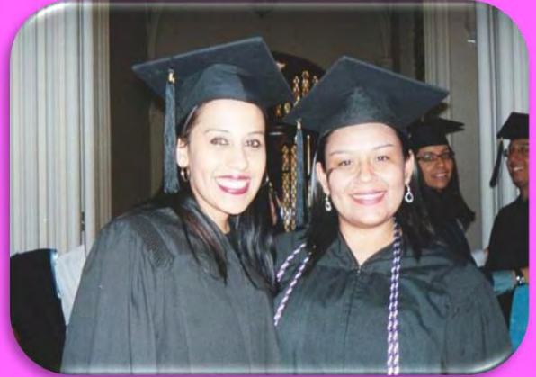
Graduating from OLLU