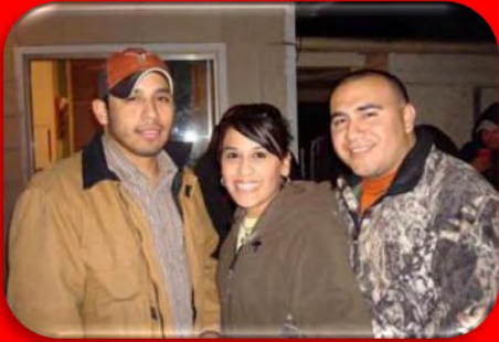
New Year's Day