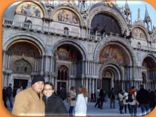
Piazza San Marco