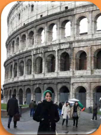
Selene at the Colosseum