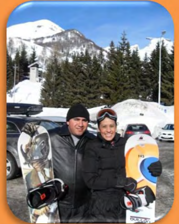
Snow boarding in Aviano, Italy