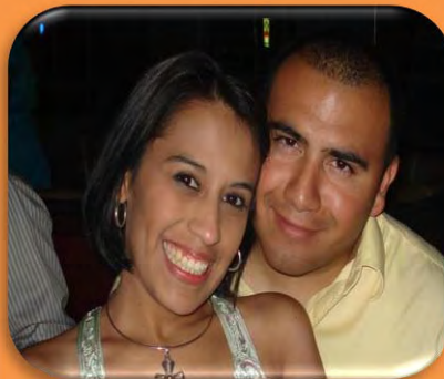
Night out in Mexico City