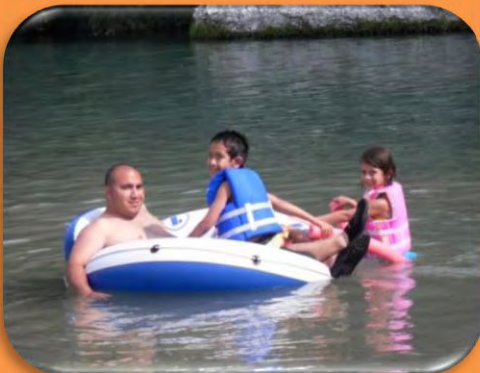
Annual trip to the River