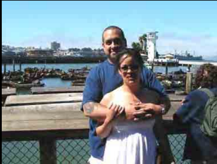
"Grow old with me, the best is yet to be. "