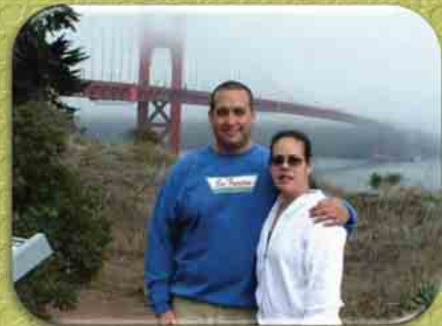
Where we got engaged