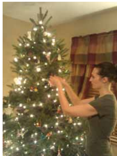
Trimming the Christmas tree