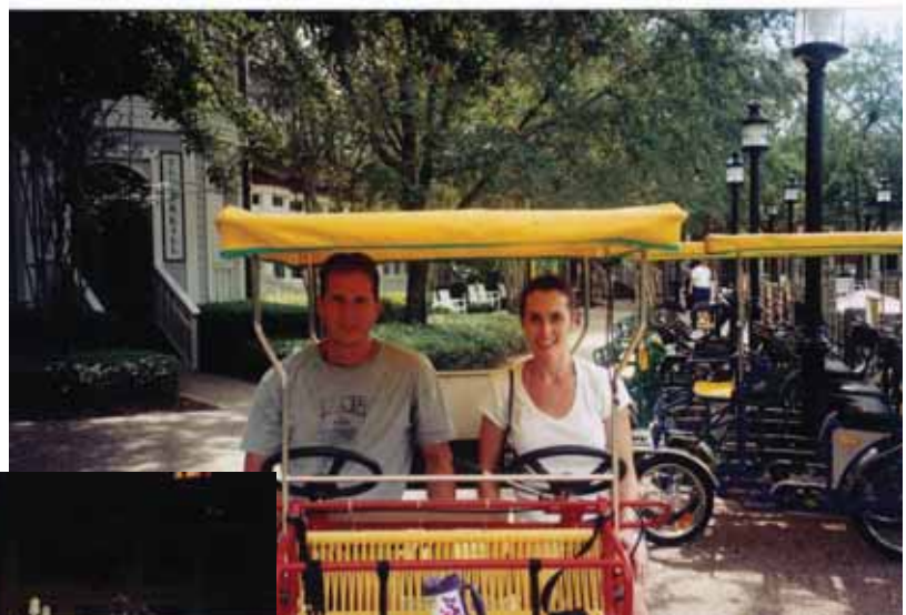
Going for a ride around our Disney hotel.