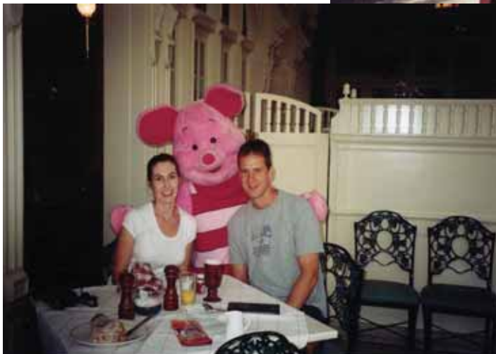
Having breakfast with Piglet.