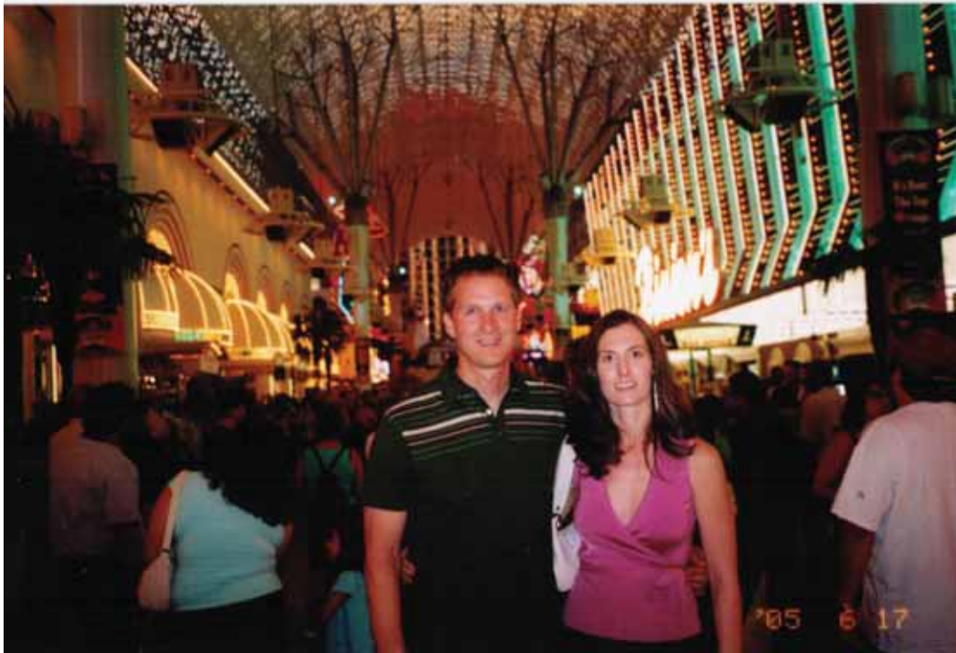
Enjoying the lights and sounds on Fremont Street in Las Vegas