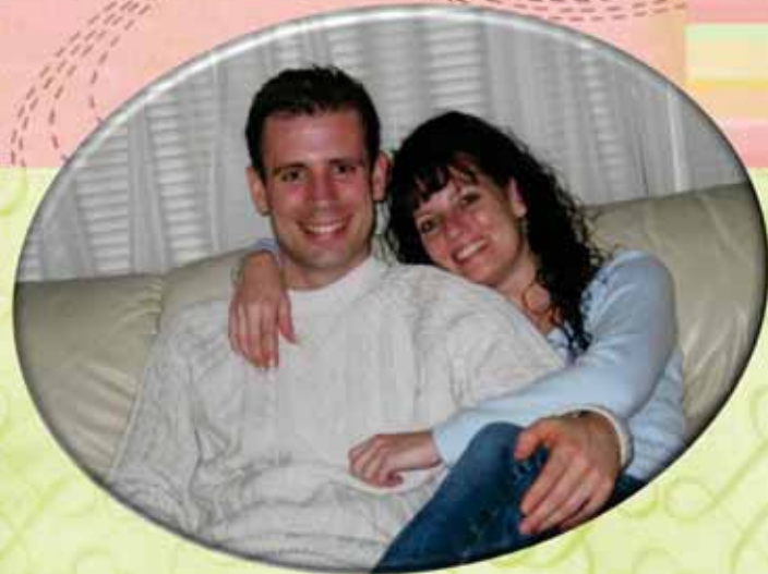
New Years Eve