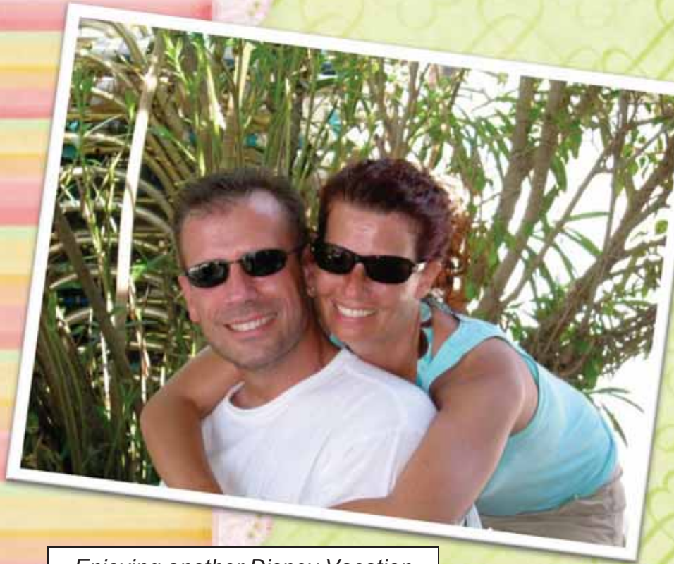
Enjoying another Disney Vacation