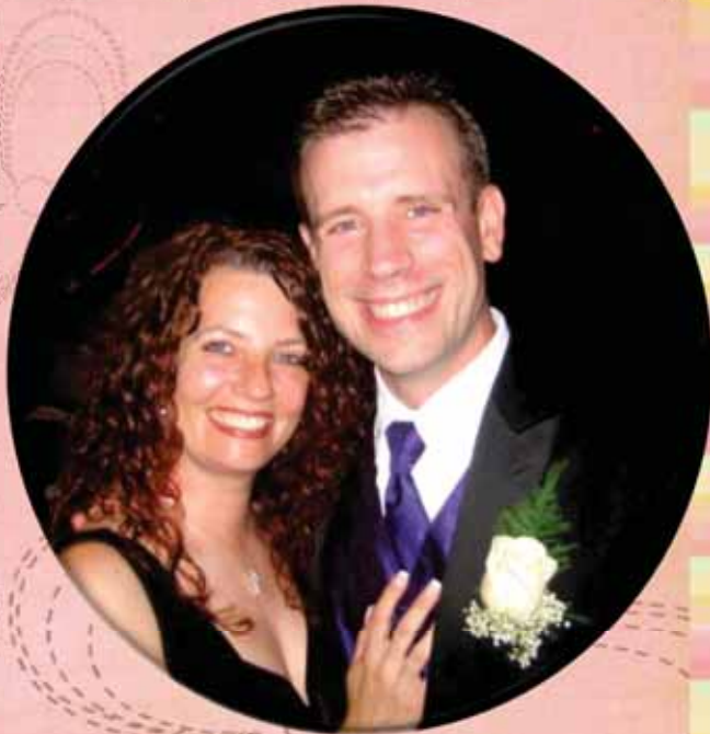
Having fun at a wedding