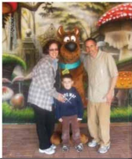
Visiting with our pal Scooby-Doo