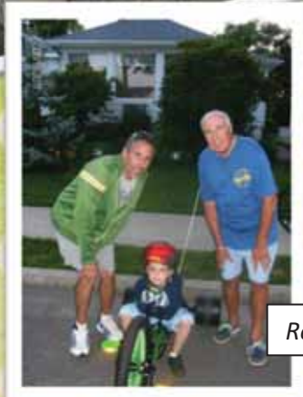
Ready to ride