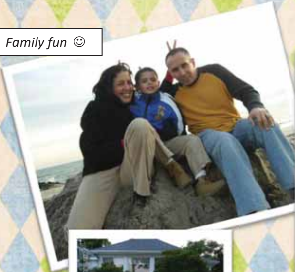
Family fun ☺