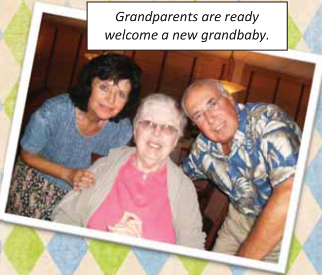
Grandparents are ready welcome a new grandbaby.