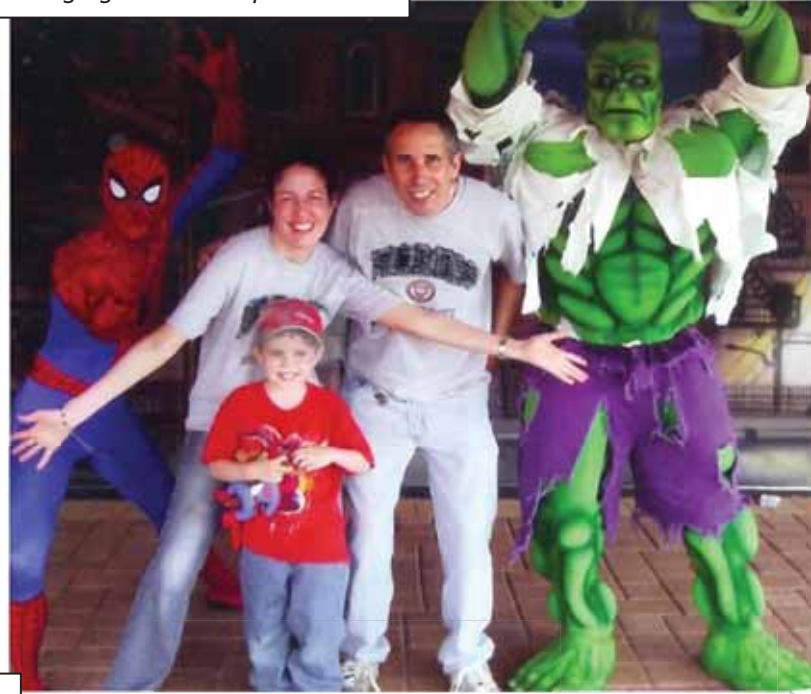
Hanging out with super heroes